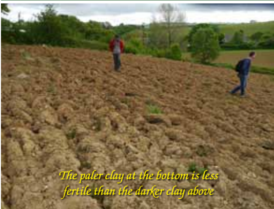
The paler clay at the bottom is less fertile than the darker clay above

At the second workshop planning this biodynamic farm (with the help of permaculture principles), we examined different ways of making farm produce available, such as box schemes or a food hub (where customers order online and the order is fulfilled by a number of farmers); and settled the plan of vegetables and fruit to be planted in different parts of the farm.