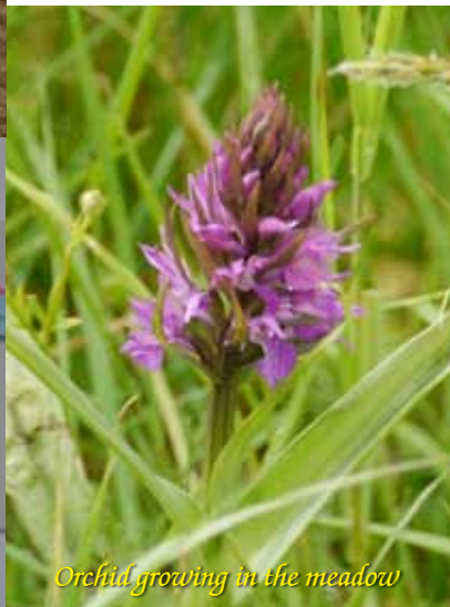
Orchid growing in the meadow