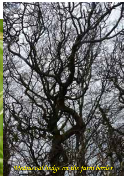
Medieval hedge on the farm border