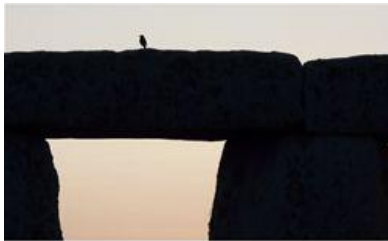
Mystical Britain 2012

The Mystical Britain 2012 wall calendar is out now! With beautiful atmospheric photos of Mystical Britain, sent in by members of Parallel Community, the calendar includes Celtic festivals and pagan holidays, solar and lunar eclipses, and also sun and full moon and new moon in their relevant astrological signs. The price is £13.52, and it is available via Lulu at http://www.lulu.com/product/calendar/mystical-britain-2012/16674948